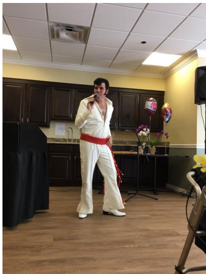
Elvis was in the building!