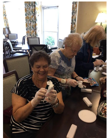
Our Baking Club made a delicious Ice Cream Cake!