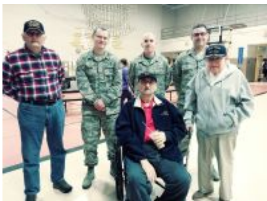
EVERYDAY HEROES CEREMONY @ NEWMARKET ELEMENTARY SCHOOL