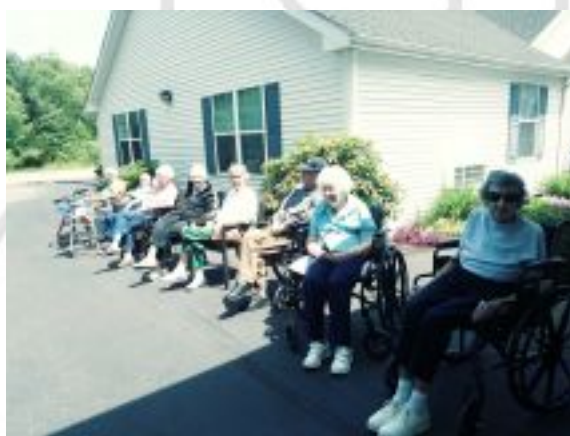
SUNNY MORNING SMILES