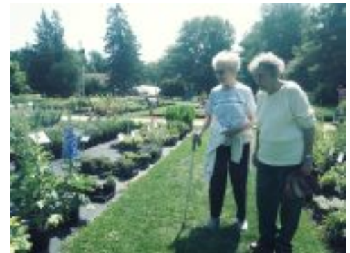
Playful garden walks make for an awesome afternoon!

Scientists say it's good for grown-ups to make time for engaging, pleasing activities for their overall health. The fun of play often involves laughter, which releases the feel-good brain chemical dopamine and boosts your mood. Research shows that incorporating play into your life can help reduce stress, foster better relationships and improve coping skills in everyday situations.