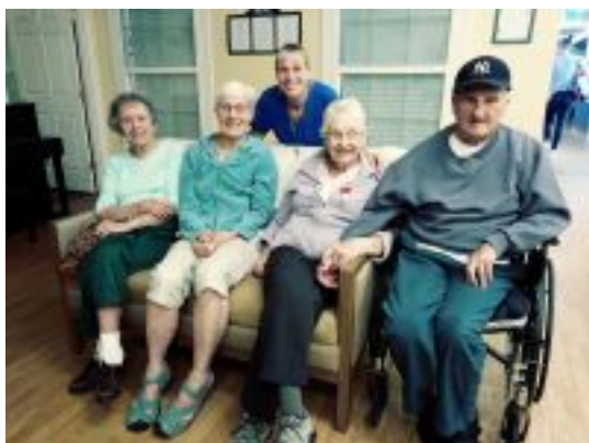
HAPPY FRIDAY FACES